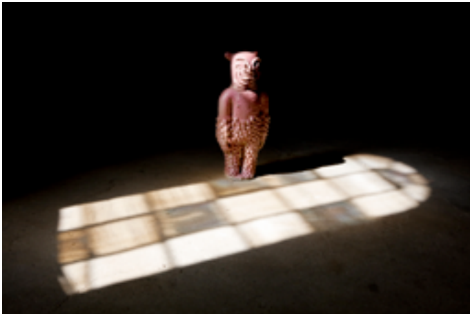
Illustration Laurent Dufour

The artists are available on the exhibition spots in order to meet the public and share their artistic philosophy.