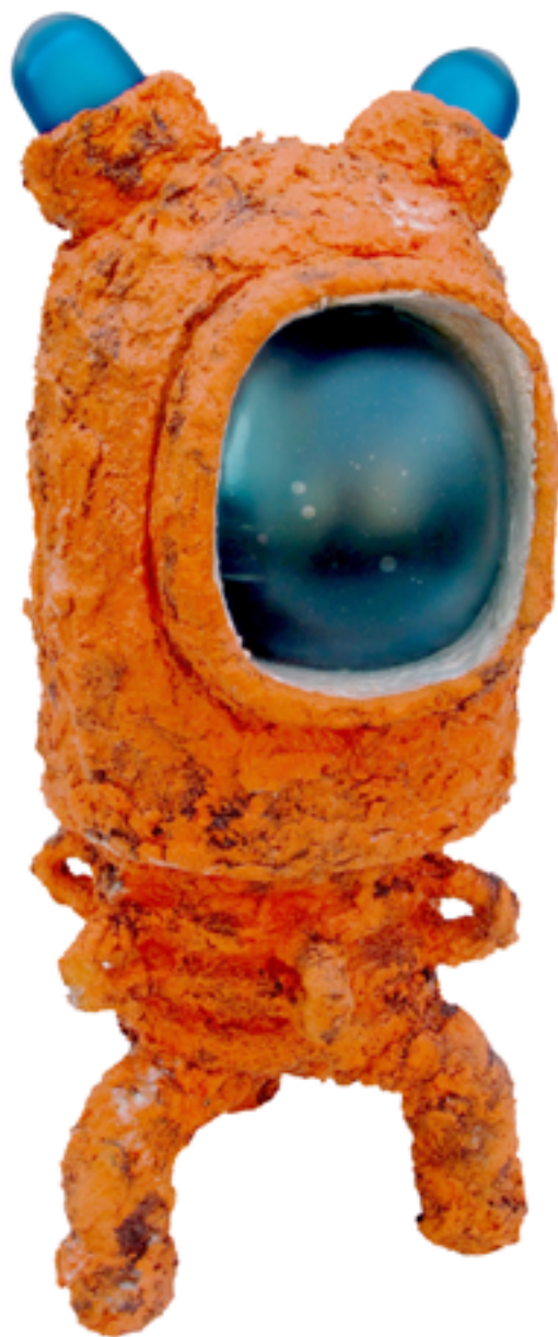
Illustration et crédit photo : Amauld le Calvé

20 EUROPEAN CERAMIC ARTIST 20 TEMPORARY EXHIBITION SPACES CONTEMPORARY ART JOURNEY