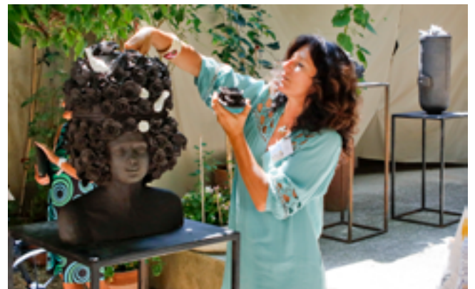
Illustration Mélanie Broglio

Saint-Quentin-la-Poterie offers plenty of ceramic activities : permanent collection of the Museum of Mediterranean Pottery, temporary exhibitions at Terra Viva Gallery (contemporary ceramic art), artist's residency where ceramicists and visual artists all around the world come to develop new projects, and pottery classes by professionals for kids and adults.